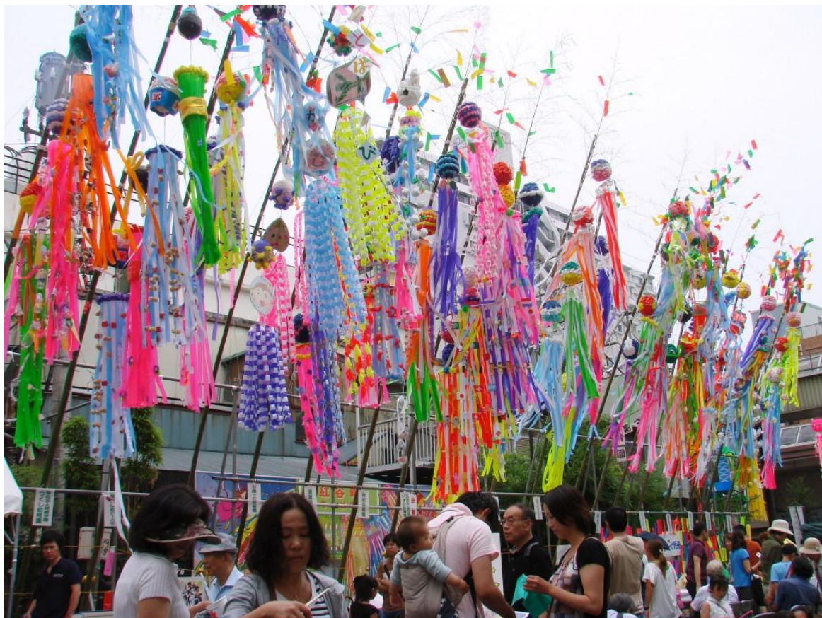
With small nobori-s

These are some photos from the Hiratsuka Tanabata festival: