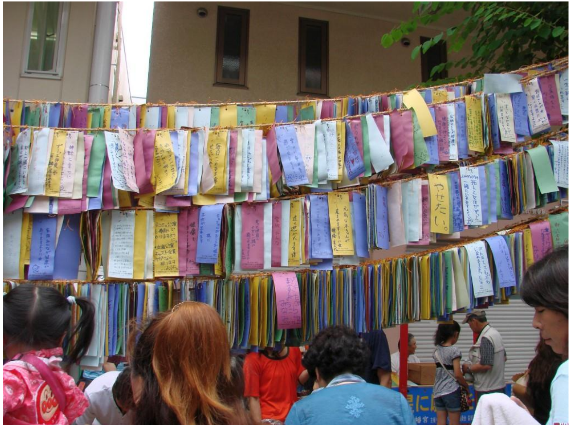
Too many wishes so they had to hang them on a rope